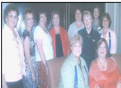
2007/2008 KIWANIANNE OFFICERS