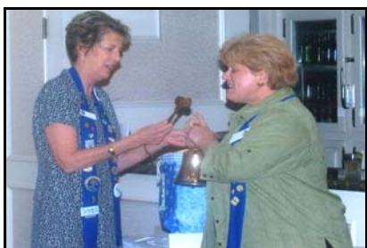
YOUR GAVEL & BELL MADAME PRESIDENT !