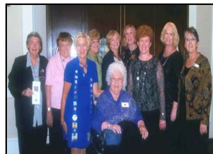
2007/2008 BOARD OF DIRECTORS