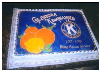
HOME GROWN SERVICE 2007/2008