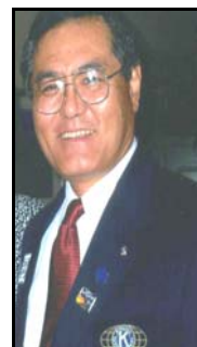
2007/2008 LT. GOVERNOR DIVISION 35