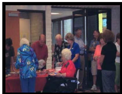
Come and Get It! Good ole fashioned fried chicken and all the trimmings!