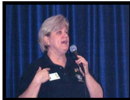
Grab your partners!!