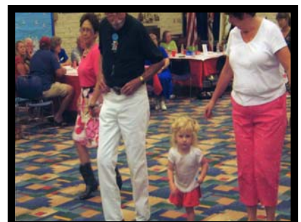
Some Grammas & Grampas are sooo much fun!!