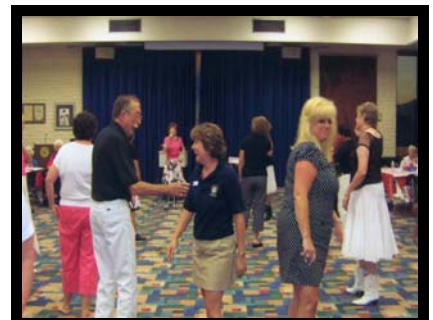
and having a good ole time!